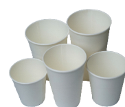
Single wall cups