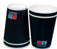
Ripple wall cups with SUP logo