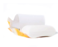
Soap wrapping paper