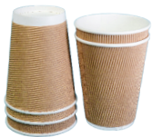
Ripple wall cups