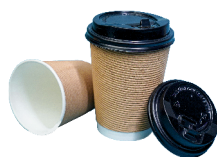
Ripple wall cups with lid