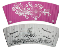
Corrugated printed fan