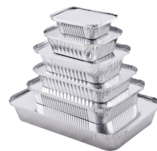
Aluminium foil container lid