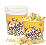
Popcorn paper tub